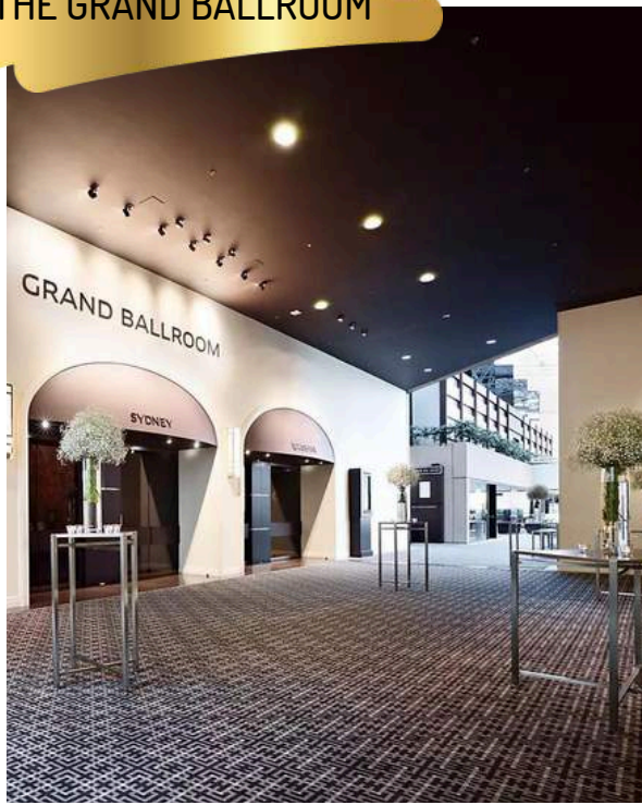
THE GRAND BALLROOM

The Grand Ballroom will be the centre stage for the Italian Business Award Gala Night 2024. Complementing the Grand Ballroom is Sofi's Lounge , an expansive room perfect for hosting the pre-event cocktail reception and exhibition and activation that highlights Sponsors' products.