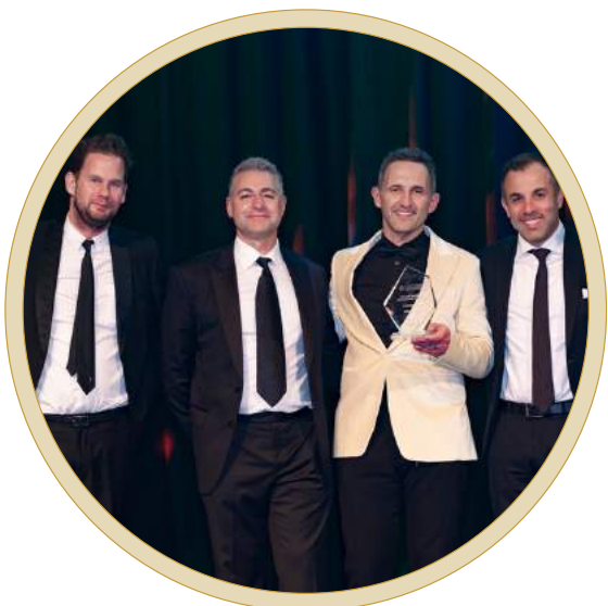
Helia EHS, winner of the Italian Business Sustainability Award 2023.