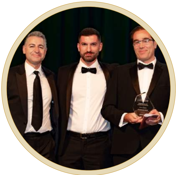
WAM Australia, winner of the Italian Innovation in Business Award 2023.